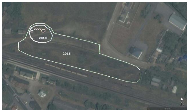
Fig. 2. The dynamics of Grindelia squarrosa (Pursh) Dunal population in Chernivtsi region during 2009–2016 Рис. 2. Динаміка популяції Grindelia squarrosa (Pursh) Dunal у Чернівецькій області (2009–2016)

It was established that the studied area of population during 2009–2016 increased to 18,500 m 2 (Map 2).